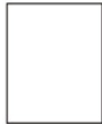
1 - 8x10