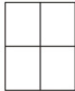
4 - 4x5